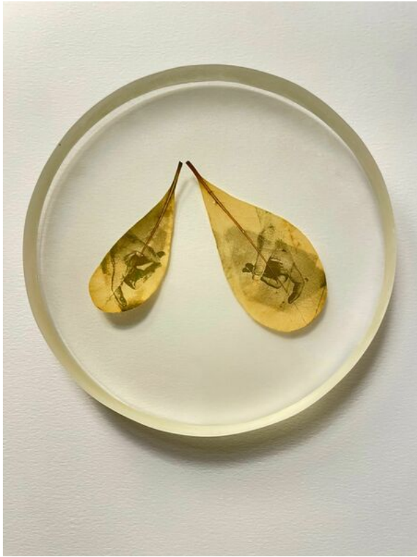
Almudena Romero , Pittosporum. The Pigment Change: The Act of Producing , 2023 Photograph printed on Pittosporum Casted in bio resin fossil.