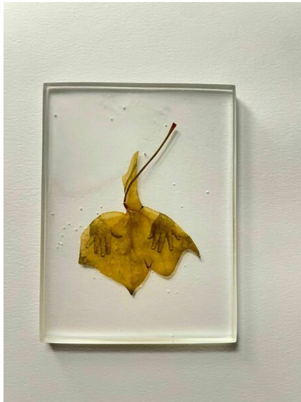
Almudena Romero, Hiedra Blanco. The Pigment Change: The Act of Producing , 2023 Photograph printed on Hiedra Blanco. Casted in bio resin fossil.