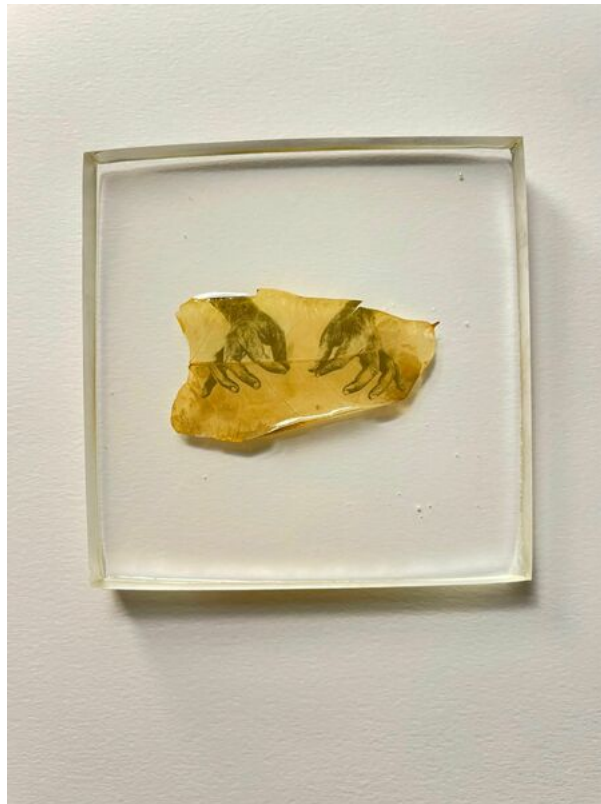
Almudena Romero, Sechium Blanco. The Pigment Change: The Act of Producing , 2023 Photograph printed on Sechium Blanco Casted in bio resin fossil.