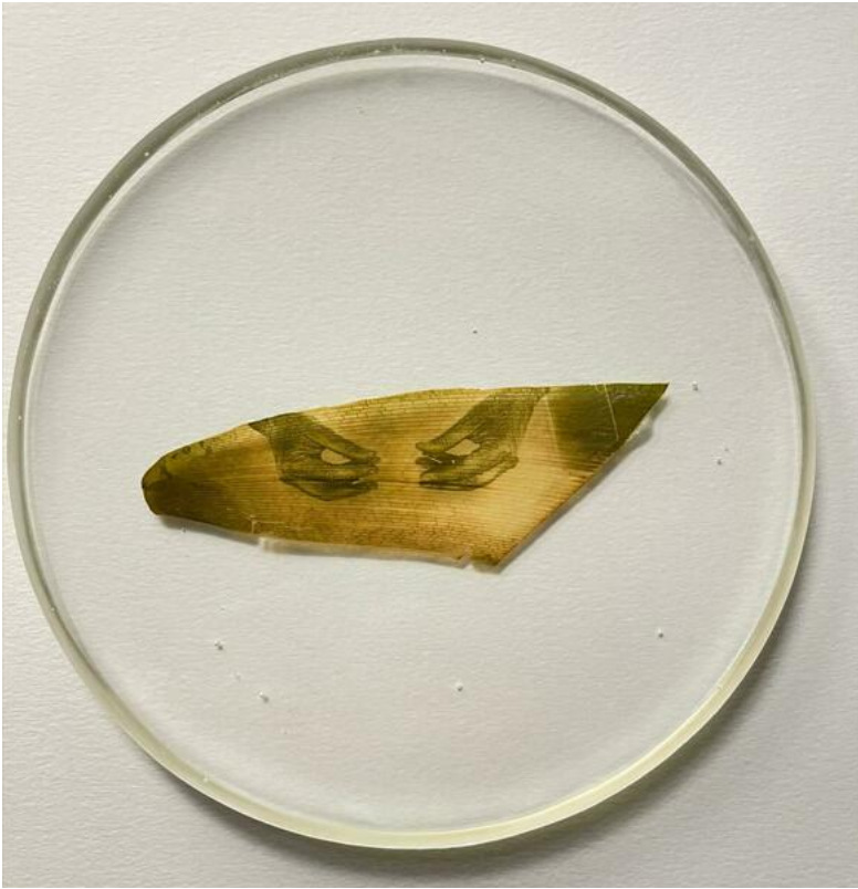
Almudena Romero, Azucena. The Pigment Change: The Act of Producing , 2023 Photograph printed on Azucena Casted in bio resin fossil.