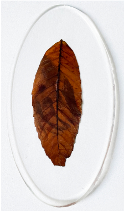
Almudena Romero, Hand on Nispero leaf Studies on my grandma's garden. The Act of Producing. The Pigment Change. , 2022 Photograph printed on Nispero leaf Casted in bio resin fossil.