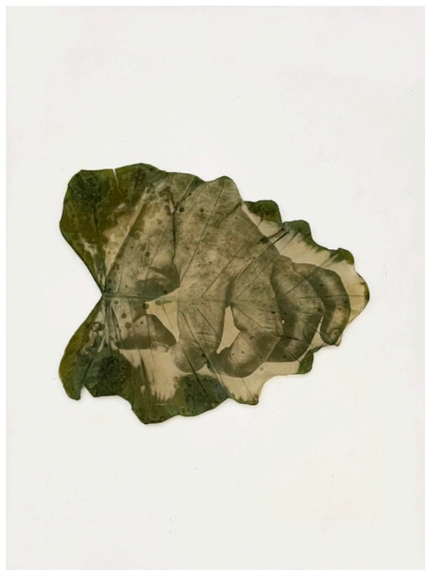
Almudena Romero, The Act of Producing , 2022 Photograph printed on leaves casted in bio resin fossil.