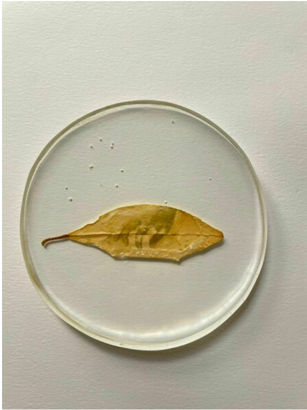
Almudena Romero, Kumquat. The Pigment Change: The Act of Producing , 2023 Photograph printed on Kumquat. Casted in bio resin fossil.