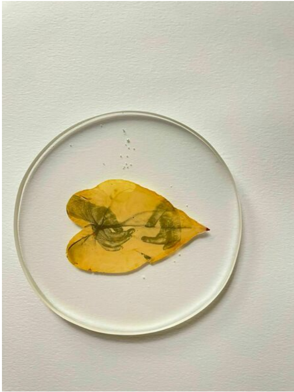
Almudena Romero, Cucullata Blanco. The Pigment Change: The act of Producing , 2023 Photograph printed on Cucullata Blanco Casted in bio resin fossil.