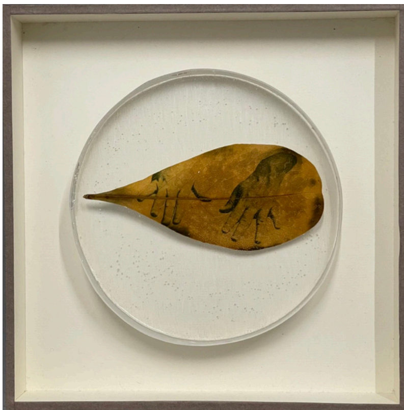
Almudena Romero, The Act of Producing , 2022 Photograph printed on leaves casted in bio resin fossil.