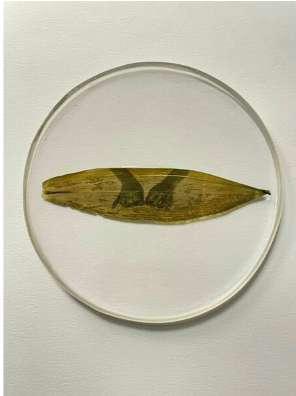
Almudena Romero , Aspidistra. The Pigment Change: The Act of Producing , 2023 Photograph printed on Aspidistra Casted in bio resin fossil.