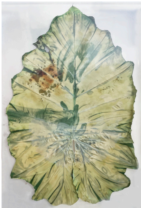
Almudena Romero, Large Scale hands on Taro Studies on my grandma's garden. The Act of Producing. The Pigment Change., 2022 Photograph printed on Taro leaf. Casted in bio resin fossil.