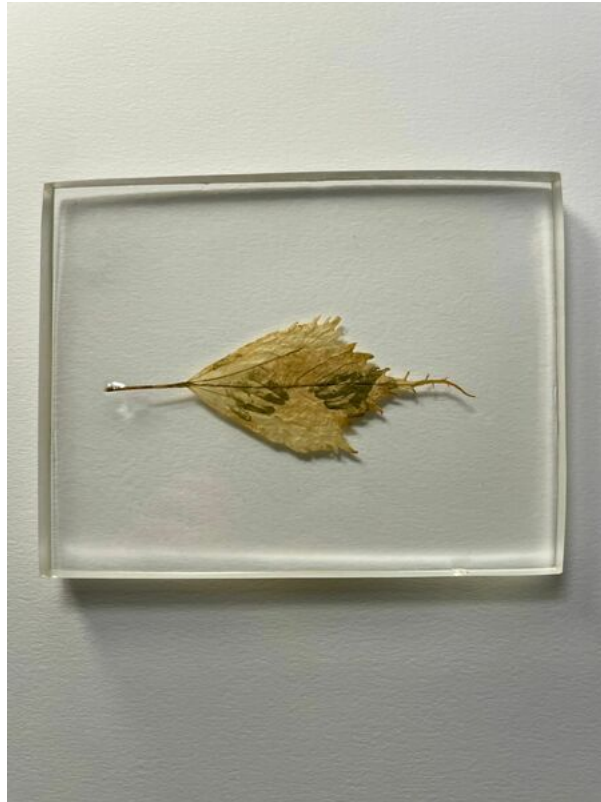
Almudena Romero , Rosa de Siria. The Pigment Change: The Act of Producing , 2023 Photograph printed on Rosa de Siria Casted in bio resin fossil.