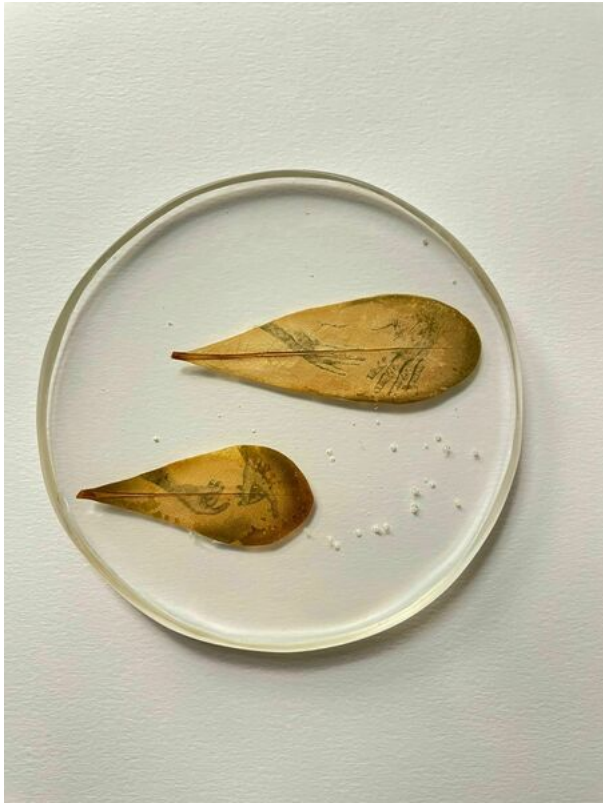
Almudena Romero , Pittosporum. The Pigment Change: The Act of Producing , 2023 Photograph printed on Pittosporum Casted in bio resin fossil.