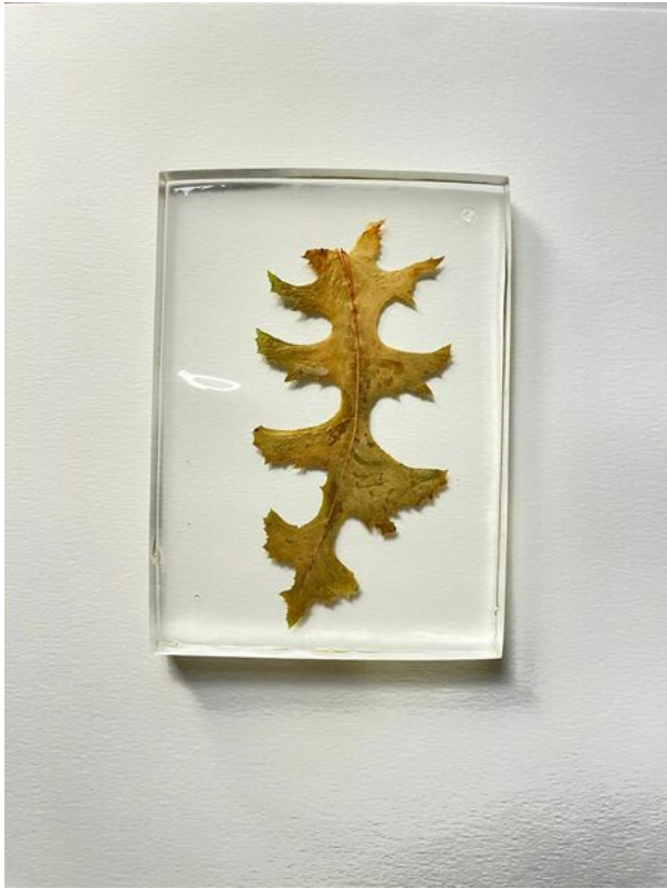
Almudena Romero, Escarola. The Pigment Change: The Act of Producing , 2023 Photograph printed on Escarola Casted in bio resin fossil.