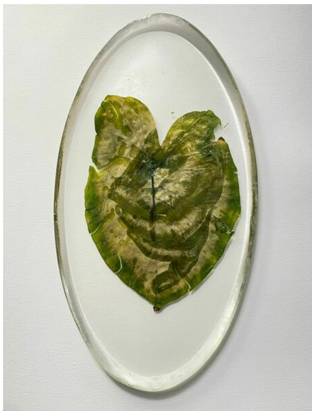
Almudena Romero, Taro Blanco. The Pigment Change: The Act of Producing , 2023 Photograph printed on Taro Blanco Casted in bio resin fossil.