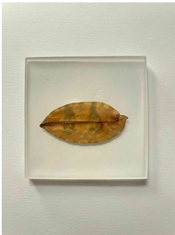
Almudena Romero, Magnolia Blanco . The Pigment Change: The Act of Producing , 2023 Photograph printed on Magnolia Blanco Casted in bio resin fossil.