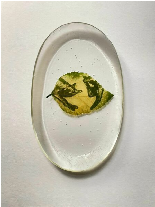
Almudena Romero, Hibiscus. The Pigment Change: The Act of Producing , 2023 Photograph printed on Hibiscus Casted in bio resin fossil.